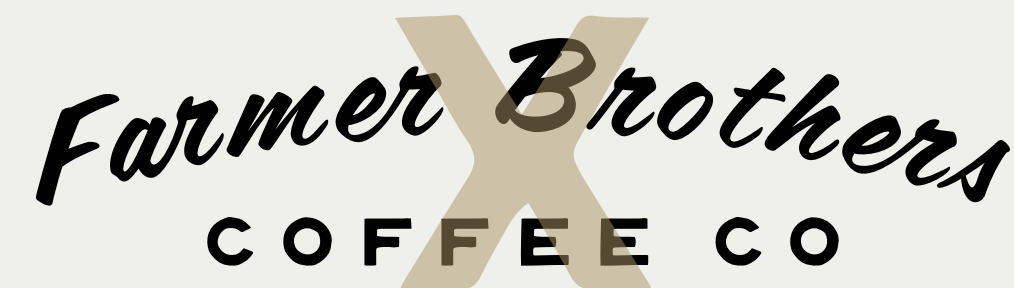
Do not portray the logo in different typefaces.