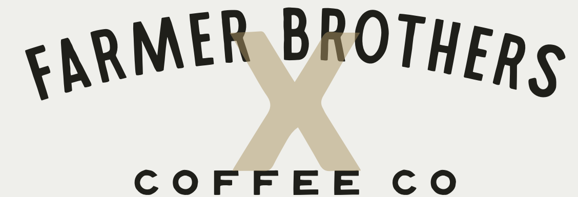
Do not alter the spacing of the logo.