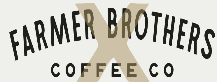
Do not skew or stretch the logo.