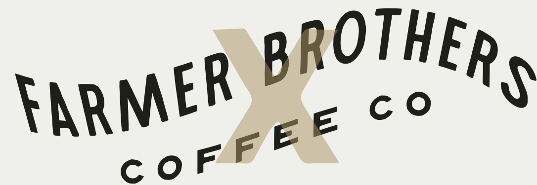
Do not warp or distort the logo.